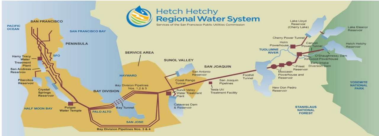
Figure 2: Hetch Hetchy Regional Water System 8

Hardening and modernizing vulnerable water infrastructure against a major earthquake is costly, disruptive, and impractical for individual water providers. Therefore, much of the local distribution system, between the SFPUC “turnout” to the water provider and their customers’ taps, is likely to be older and more vulnerable to earthquake damage. 9