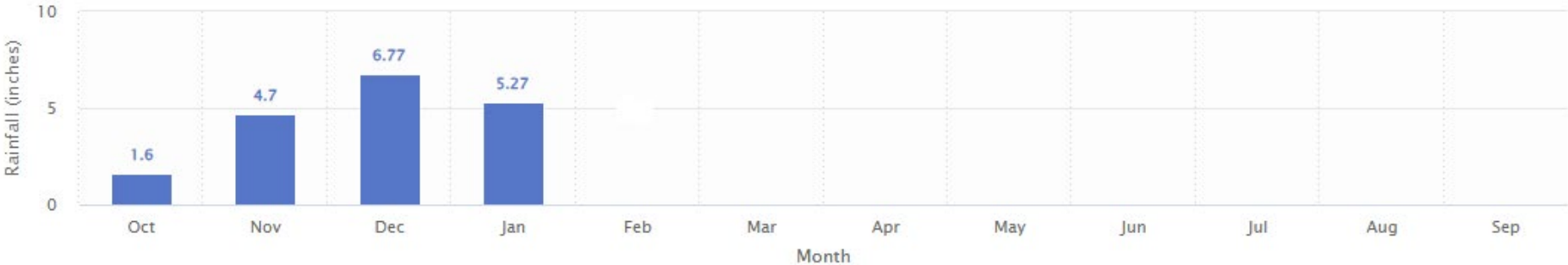
Monthly Rainfall for Current Water Year